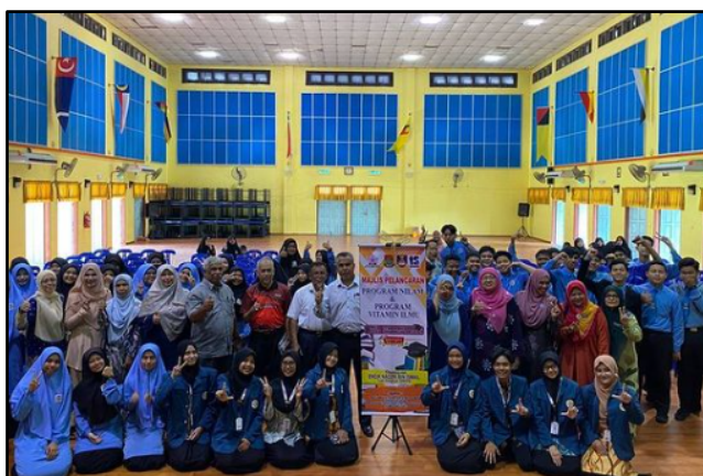
Figure 1: Inauguration of NILAM

The first activity carried out in this program was the inauguration session of the NILAM (Nadi Ilmu Amalan Membaca) program which is a unified reading movement program for all schools in Malaysia. The NILAM program is an approach initiated to address issues related to low reading and literacy habits among students. The aim of the NILAM program is to make students love reading and to encourage schools to maintain creative and innovative ideas in an effort to improve students' reading skills.