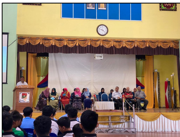
Figure 2: Sharing Session

students to the students of Sekolah Menengah Kebangsaan Pangkal Meleret, welcoming the event with traditional dances to introduce Indonesian culture, presentations about school libraries in Indonesia, presentations about academic (university) libraries in Indonesia, game sessions, and ended with singing together "Laskar Pelangi" to build bonding with students of Sekolah Menengah Kebangsaan Pangkal Meleret.