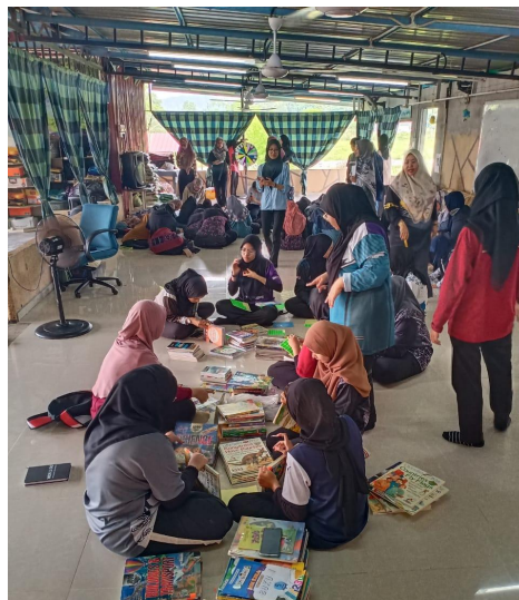
Figure 4: Mini Library Classification Activity

CSR activities are carried out at Lilbanat Darulnaim Machang Orphanage with the main project of building a mini library to make it easier for orphans and residents of the house to get the latest and appropriate information. The library can provide facilities for orphans to utilise free time with useful activities.