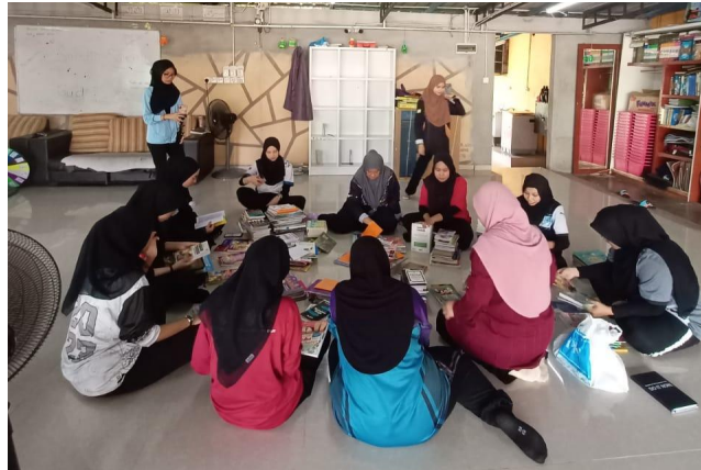
Figure 3: Set Up Mini Library

CSR activities are carried out at Lilbanat Darulnaim Machang Orphanage with the main project of building a mini library to make it easier for orphans and residents of the house to get the latest and appropriate information. The library can provide facilities for orphans to utilise free time with useful activities.